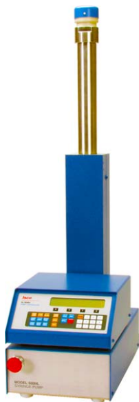
Figure 1: Single HL Series pump (Model 500HL shown)

Available models and their basic specifications are listed in the table at the top of this page. For complete specifications, refer to Teledyne Isco's Series HL Hazardous Location Pumps web page.