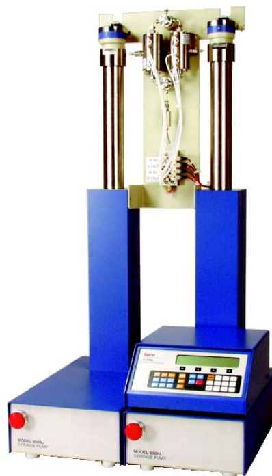
Figure 3: Dual pump system for continuous flow (A500HL with air valves shown)

For installation and plumbing connections, refer to TB01 Multiple Pump Systems for Continuous Flow or Independent Modes .