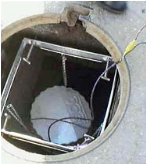
6712 Full-size sampler installation in manhole

A 6712 full-size automatic sampler from Teledyne Isco, Inc. is at the heart of portable systems that remotely monitor water quality from industrial sites in Granada, Spain.