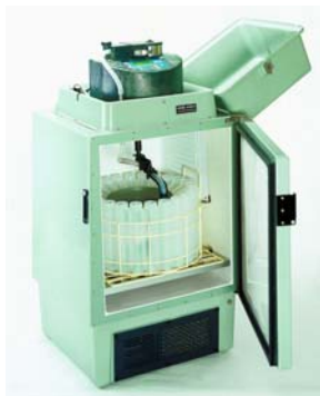
6712 FR refrigerated sampler