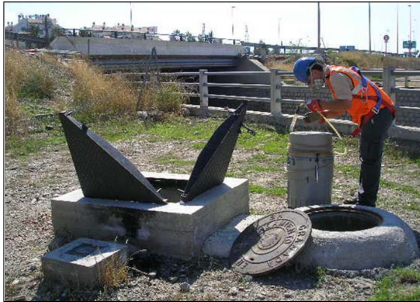
Full-size portable sampler at a remote site

A 6712 full-size automatic sampler from Teledyne Isco, Inc. is at the heart of portable systems that remotely monitor water quality from industrial sites in Granada, Spain.