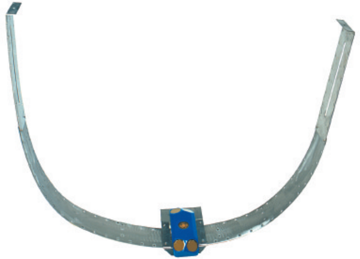
Partial Band for Pipes > 48" Diameter