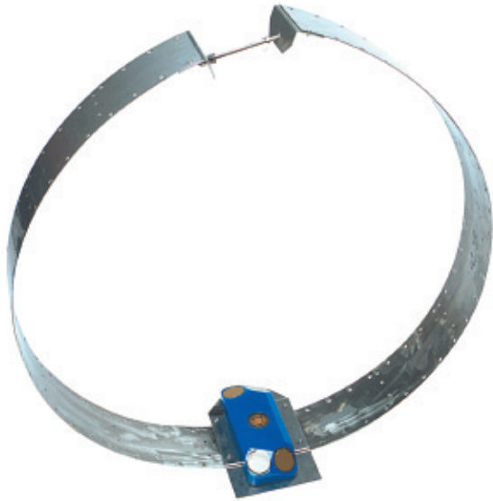
Full Band for Pipes \leq 48" Diameter