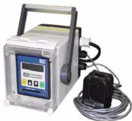
4501 Pump Station Monitor