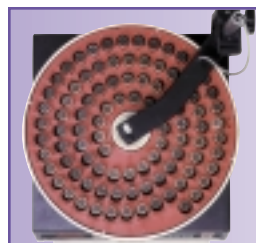
Competitor B 95 tubes 870 cm 2 29 cm wide