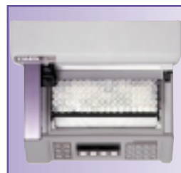
Competitor A 105 tubes 957 cm 2 33 cm wide