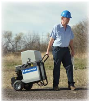
Portable refrigerated models for sequential or composite sampling — an Isco exclusive!

IscoLease — your key to affordable regulatory compliance.