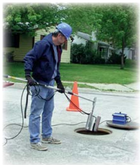
Choose from a wide variety of advanced instruments that deliver unmatched accuracy!