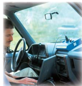
Retrieve data from the safety of your vehicle or the comfort of your desk!